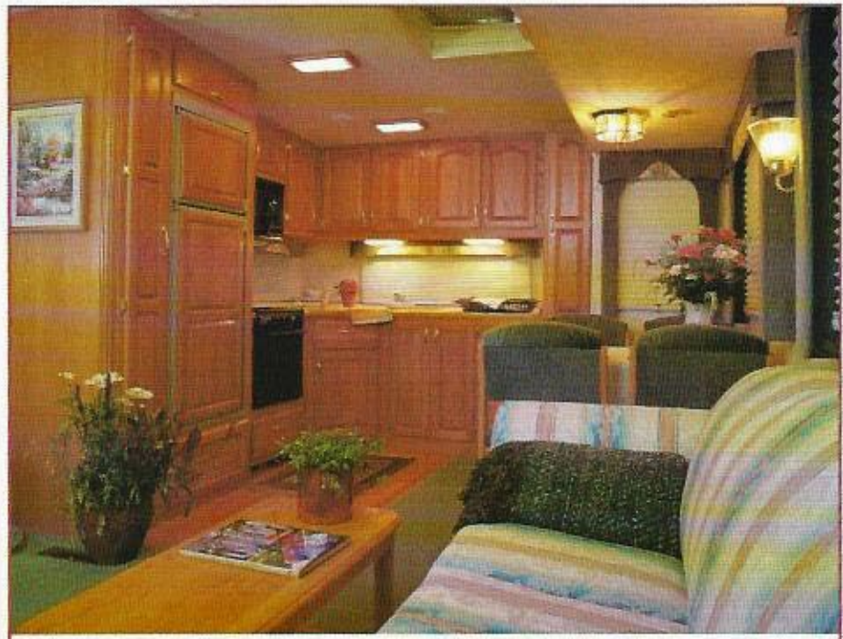
Forest Glen Decor