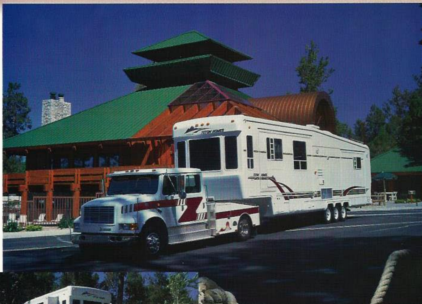
The Las Vegas III arrives at Big Bear Lake RV Park.

40' Las Vegas III with front living room which expands to 15', another first by Teton Homes®.