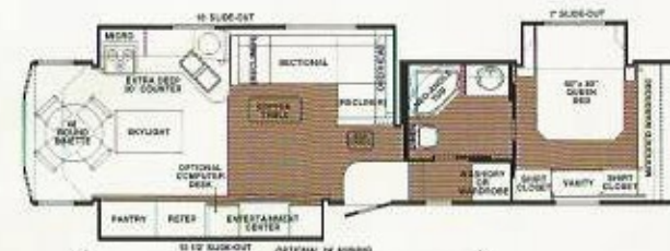
38' RK MONTEREY XT3 ROYAL (SIDE AISLE)