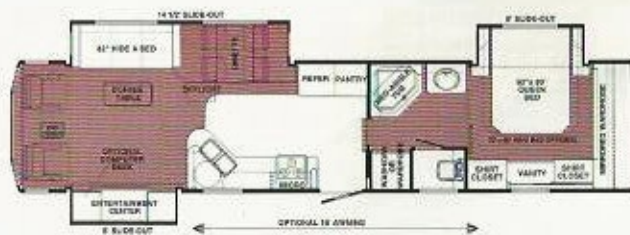
38' RL SAN DIEGO III ROYAL