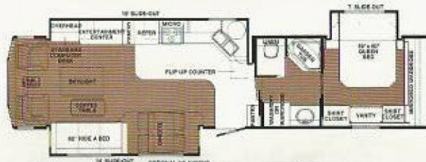
38' RL PASADENA XT3 ROYAL