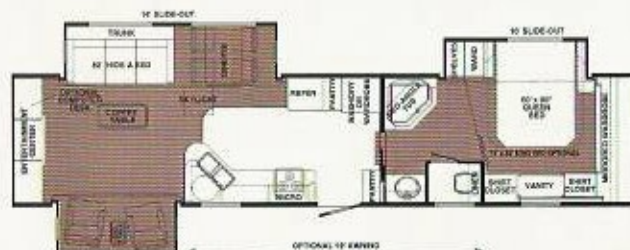
40' RL AUGUSTA III ROYAL