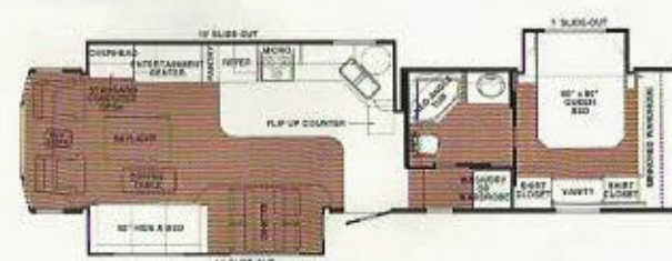
38' RL MIAMI XT3 ROYAL (SIDE AISLE)