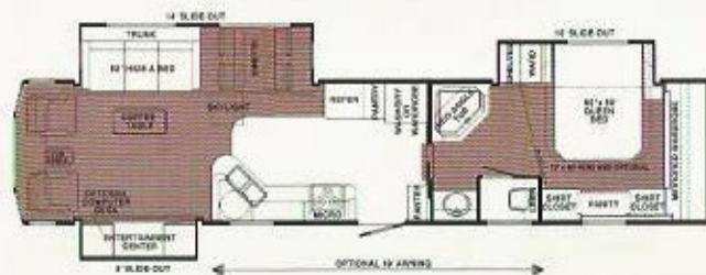
40' RL SAN GABRIEL III ROYAL