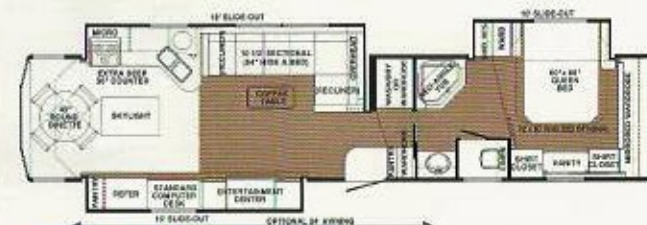
40' RK TUCSON XT3 ROYAL

All Tetons® offer triple slide-outs, vacu-bond hard wall sidewalls, vented attic, 7" roof with R-25 insulation factor, ducted air conditioning and dual ducted furnaces with 62,000 BTUs of heat on all but Phoenix models.