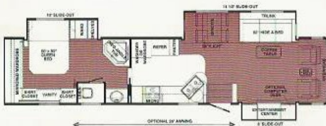
40' FL LAS VEGAS III ROYAL