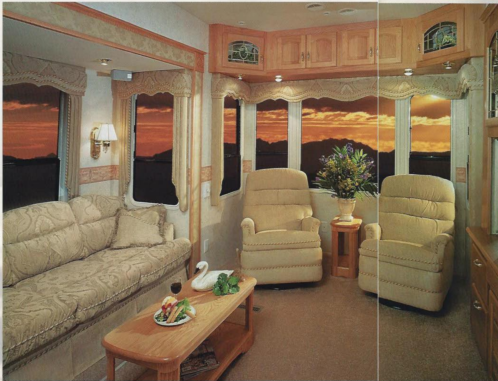
39' Frontier XT3 Royal with Castille decor.