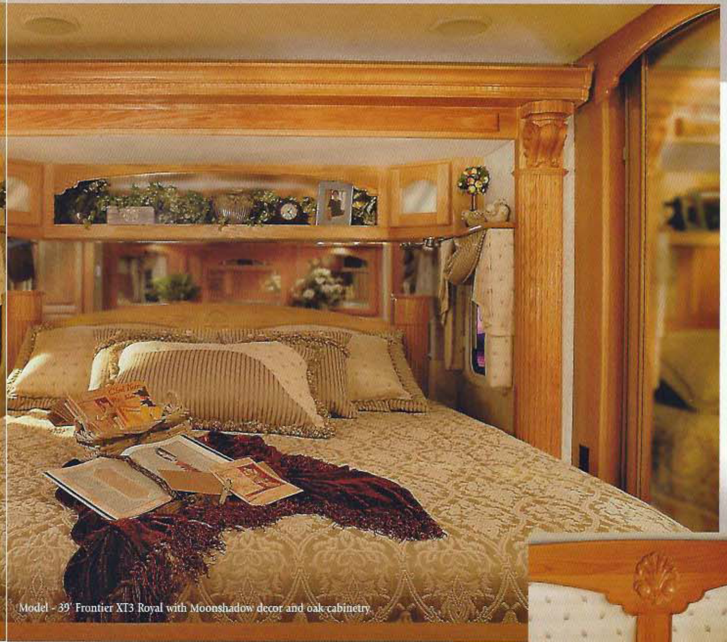
Model - 39' Frontier XT3 Royal with Moonshadow decor and oak cabinetry