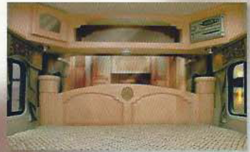
The optional solid hardwood, raised panel headboard, with fluted bed posts, shown above in natural maple, is available on all model lines.