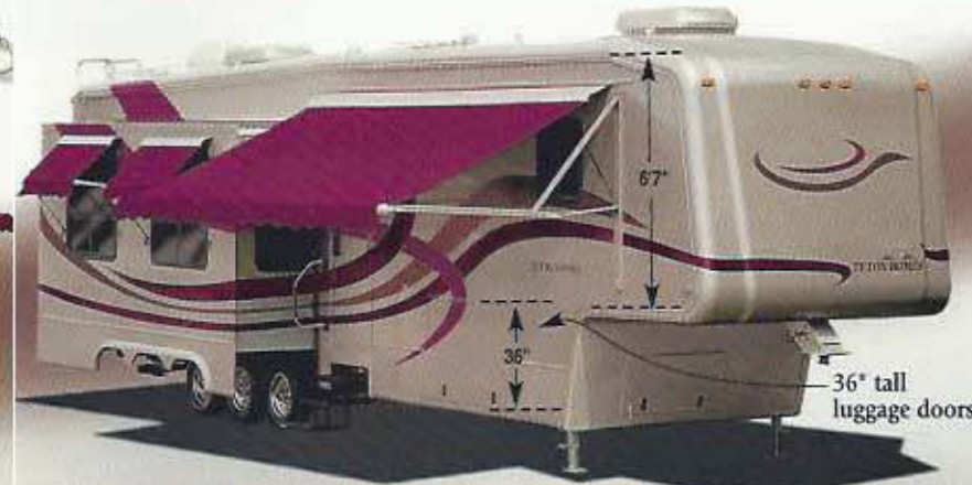
36" tall luggage doors

Outside, Royal is sleek and beautiful with a choice of full body paint designs, all with sweeping painted graphics and protective clear coat. Optional awnings are color matched to exterior paint schemes and feature a wind sensor that automatically closes the awning in sustained winds, an automatic water release and a hand-held remote control.