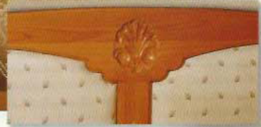
Standard Royal Headboard