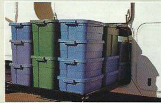
18 gal., 14 gal. and 10 gal. storage bins shown