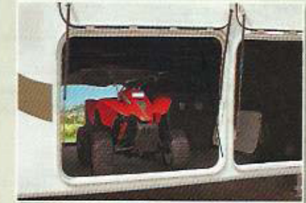
Full-width slider panels for easier access to electrical panels