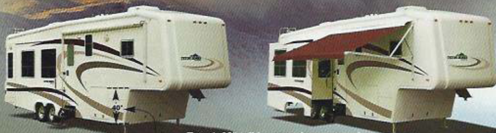
Teton's 40" tall luggage doors conceal the industry largest storage compartments.

Nothing says 'welcome' like this cozy optional fireplace