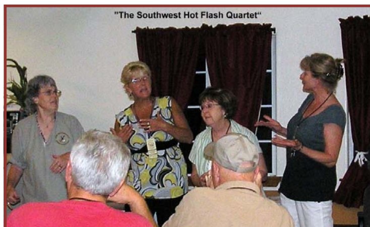
SW Hot Flash Quartet