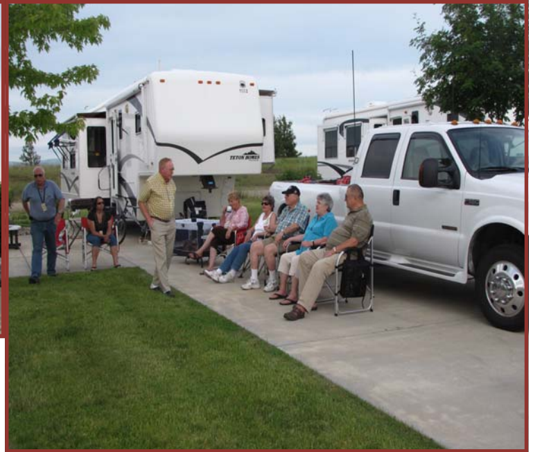
More spectators and players waiting for Cowboy Golf to start.