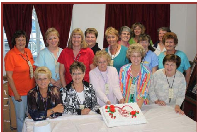
SW members celebrating Mothers Day