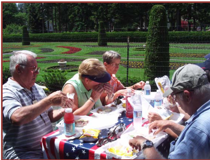
Following the guided tour, a picnic lunch was enjoyed on picnic tables overlooking the formal garden.