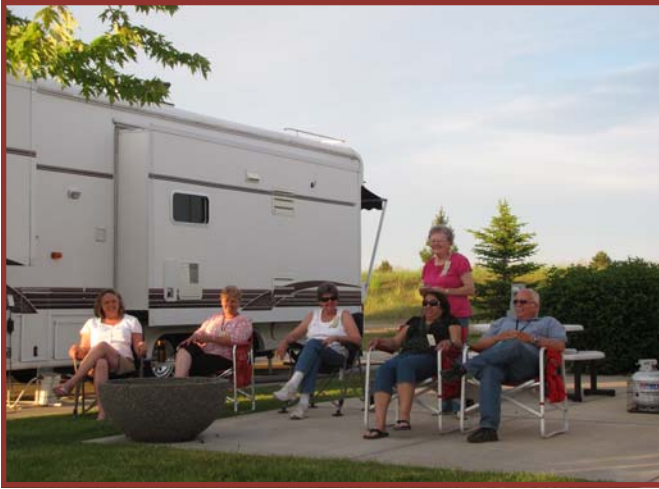
Spectators waiting their turn for Cowboy Golf