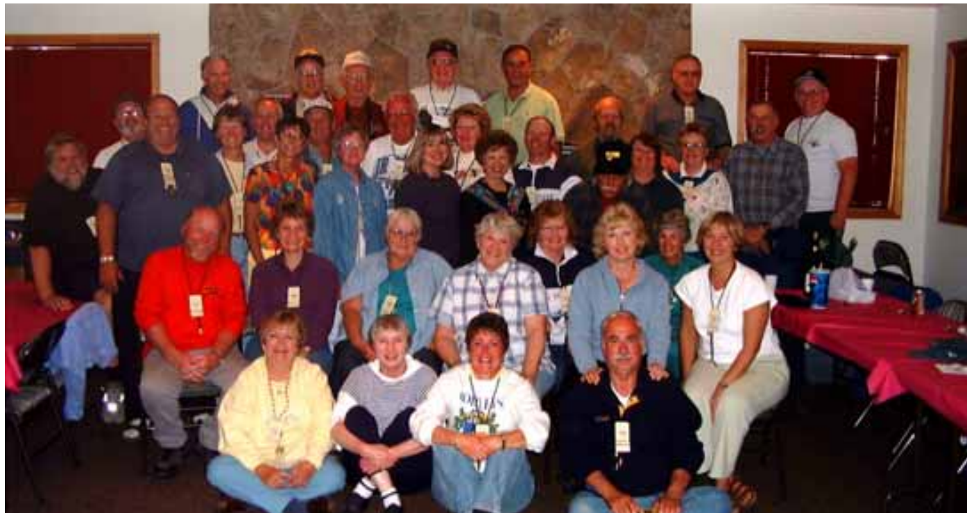
Northwest Region TCI club gathers together for a group photo at the 2001 regional rally.