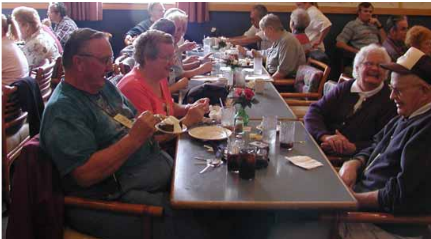
Florida Tetoners gather together for a great buffet at Homers Restaurant.